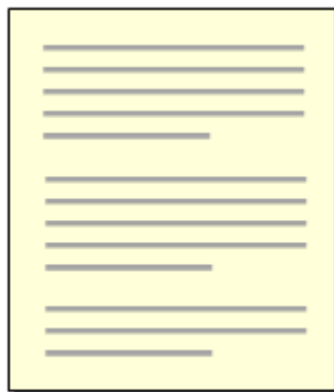
Reading for Knowledge